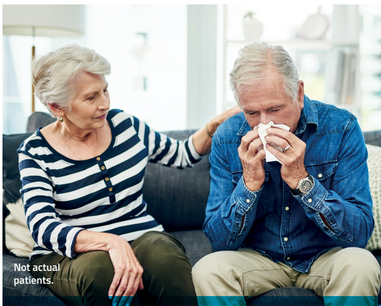
Not actual patients.

It is a common symptom in certain neurodegenerative diseases, such as Parkinson's disease (PD).